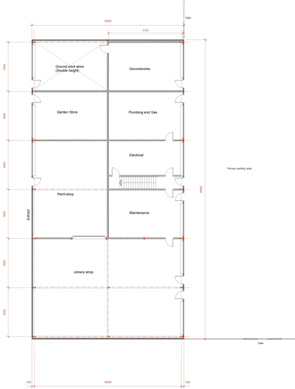
Ground Floor Plan 1:100