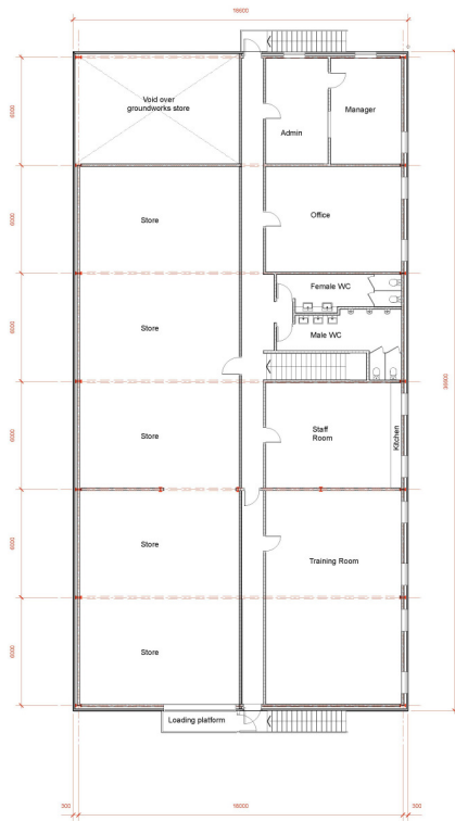
First Floor Plan 1:100